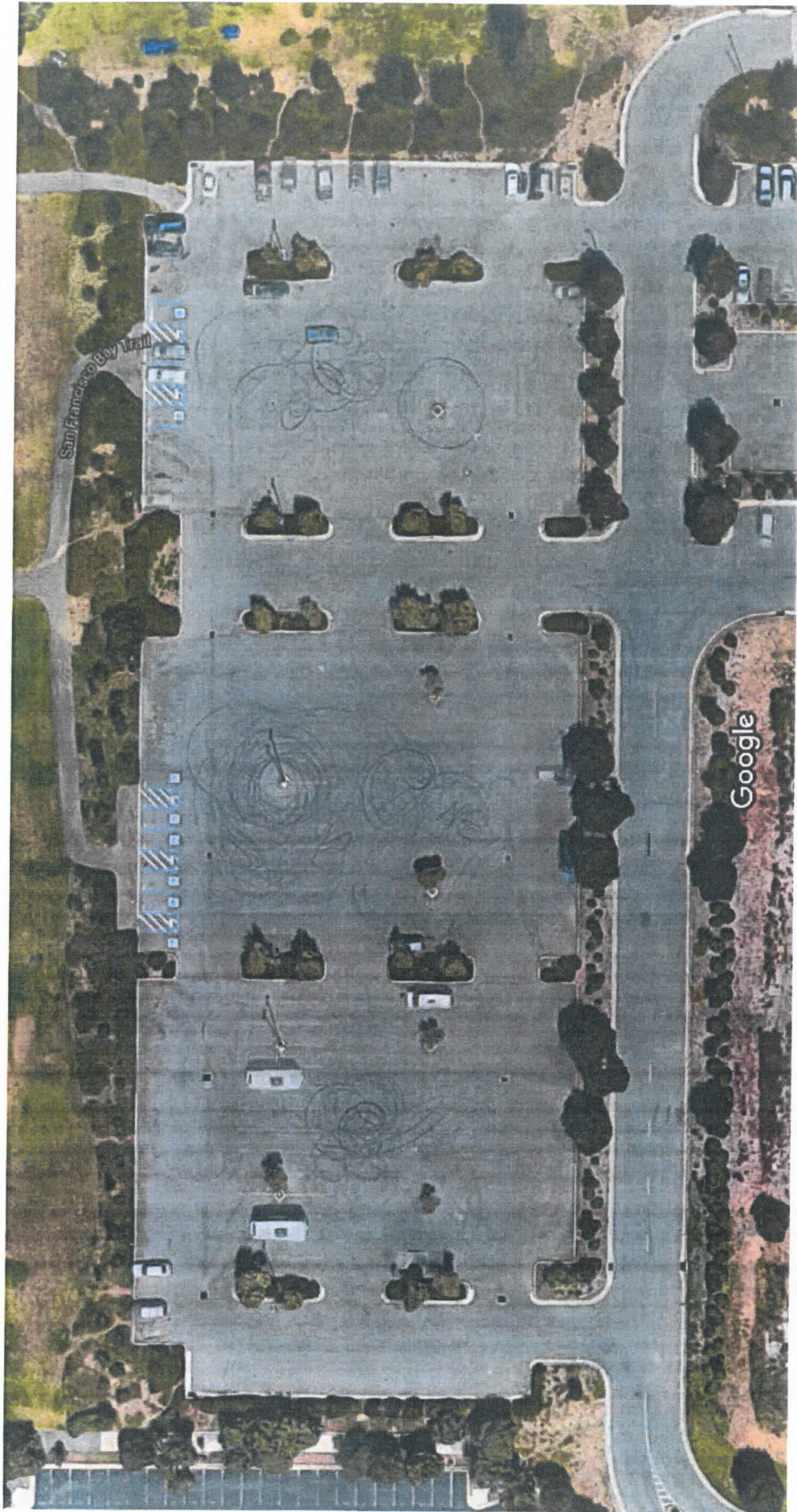
Imagery ©2016 Google, Map data ©2016 Google 50 ft