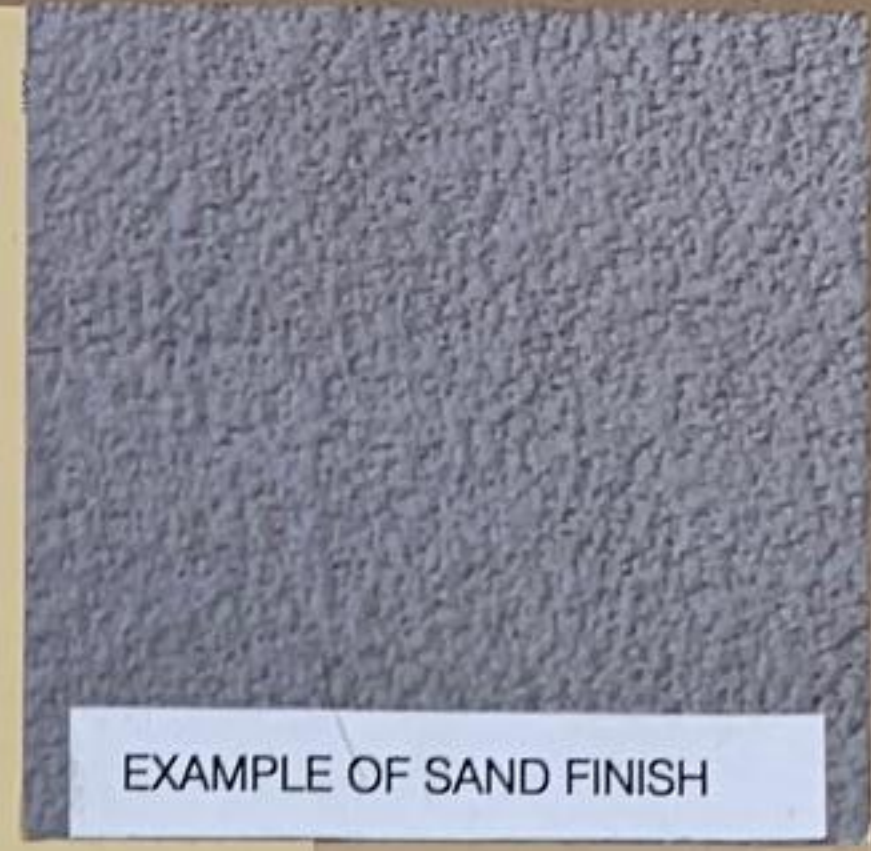
EXAMPLE OF SAND FINISH

CSP-970 CSP-970 Aura COLOR STORIES RÉCIT COULEUR COLOUR STORIES Shortbread Malted Sable