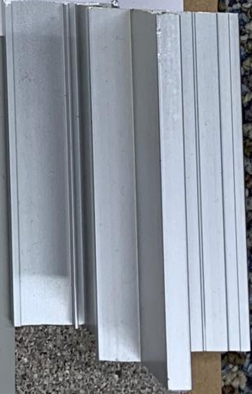
PILASTER - CEMENT PLASTER/STUCCO - SAND FINISH: BENJAMIN MOORE CSP-285 CAMEL HAIR