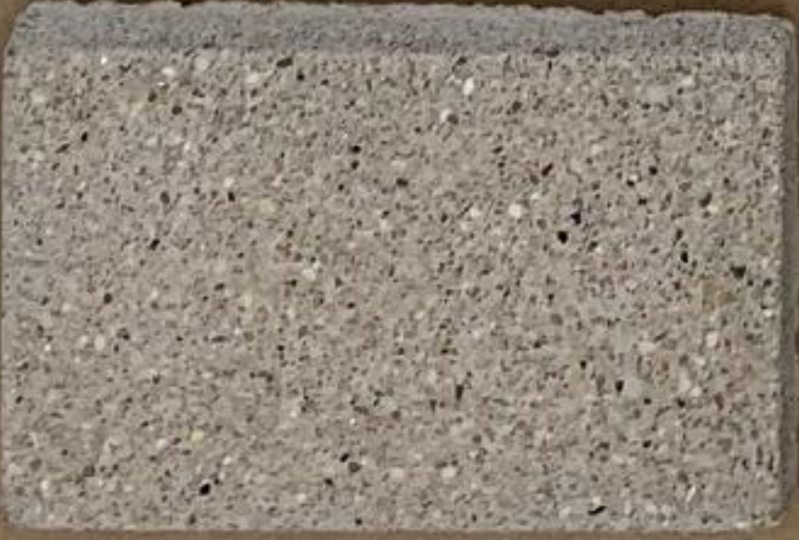
CONCRETE BASE - SMOOTH FINISH: BENJAMIN MOORE CSP-110 VINTAGE PEWTER

CSP-110 CSP-110 Aura COLOR STORIES RÉCIT COULEUR COLOUR STORIES Vintage Pewter Pétre Antiquo Étain Antique Vintage Pewter Pétre Antiquo Étain Antique