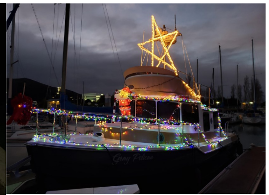
One of the many decorated boats

Taking a brief moment to look back at December, I want to say thank you to Sierra Point Yacht Club for hosting the Decorated Boat Contest, the dinner afterwards and allowing myself to be included as one of the judges—great times had by all that were able to attend! If you were around, you may have seen there were quite a few boats lit up and creatively decorated; this made the judge's job significantly harder! I will definitely look forward to seeing all the festive decorations again next year!!