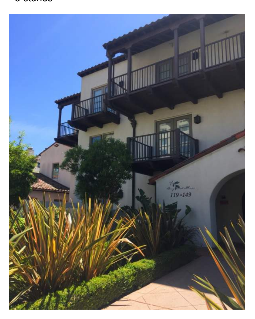
Baywood Place, San Mateo 17 condominiums on 0.75 acres = 23 du/ac 3 stories