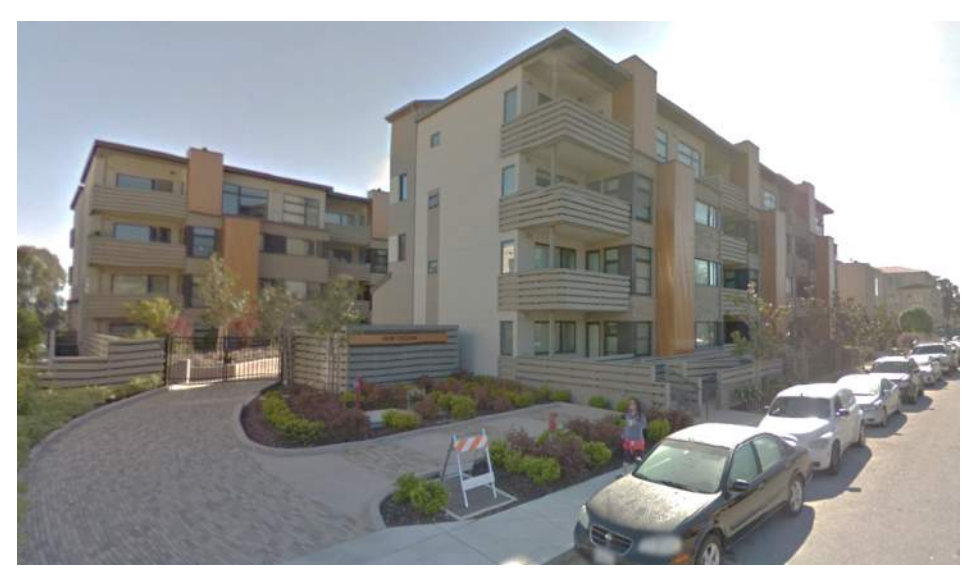
1838 Ogden Drive, Burlingame 45 condominiums on 0.89 acres = 50 du/ac 4 stories