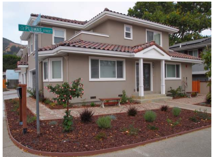
30-50 Mariposa Street Triplex (1991) 25 du/ac

80 Plumas Street, 108 and 118 Mariposa Street Triplex (2016) 26 du/ac