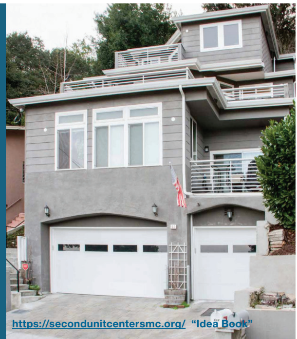
https://secondunitcentersmc.org/ “Idea Book”