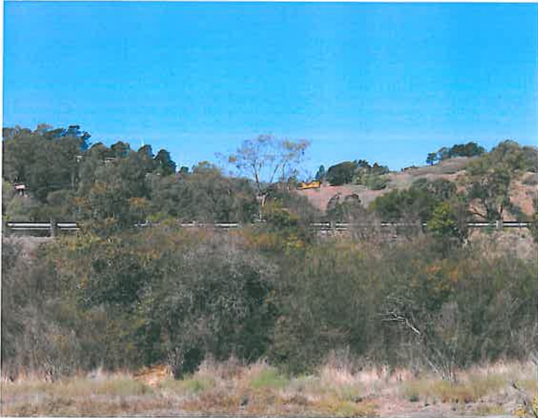
S1968-40mm; End of Paved Trail