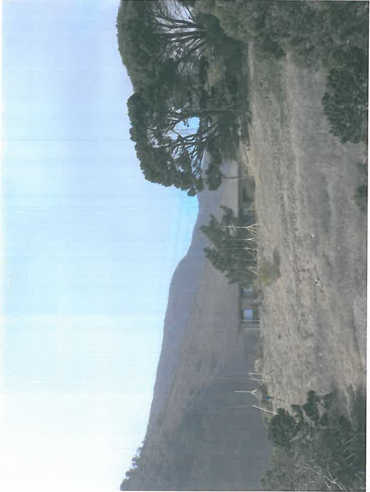
Applicant's Photo A