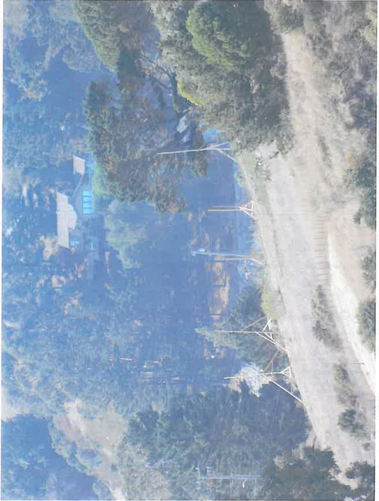
Applicants Photo B